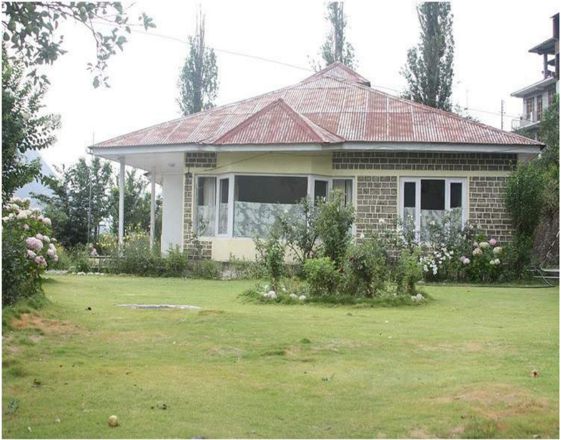
d) Sessions House, Keylong