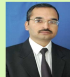
Senior Civil Judge(ACJM), Theoa