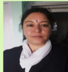
Senior Civil Judge(ACJM) 1, Shimla