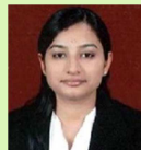
Civil-cum-JMIC, Court No. 4, Shimla