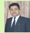
Mobile Traffic Magistrate, Shimla & Kinnaur