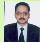
Secretary DLSA, Shimla