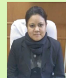
Civil-cum-JMIC, Court. 2, Rohru