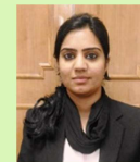
Civil-cum-JMIC, Court No. 8, Shimla