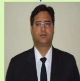
Senior Civil Judge(ACJM) 2, Shimla