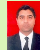
Senior Civil Judge(ACJM) 1, Rohru