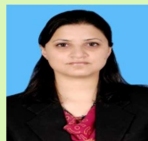
Civil-cum-JMIC, Court No. 3, Shimla