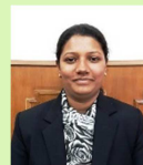
Civil-cum-JMIC, Court No. 6, Shimla