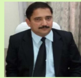
Addl. District & Session Judge -I, Shimla