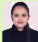
Civil-cum-JMIC, Court No. 5, Shimla