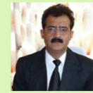
Addl. District & Session Judge(CBI), Shimla